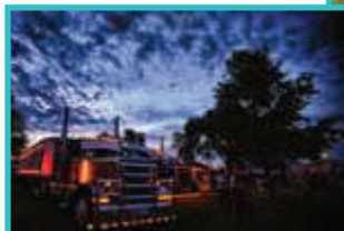
Above: The Wheel Jam Truck Show Light Show illuminates the evening on Saturday. Right: Cars of all types will be on display during Wheel Jam.

Learn more about Wheel Jam at http://www.wheeljam.com/ or by calling the South Dakota State Fair office at 800-529-0900 or 605-353-7340.