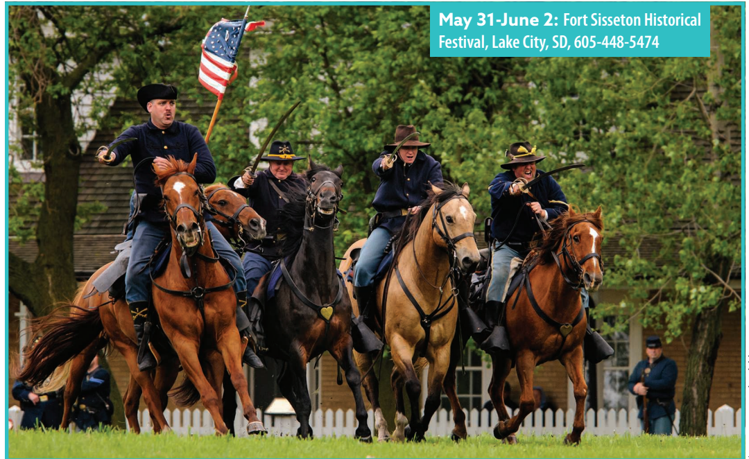
May 31-June 2: Fort Sisseton Historical Festival, Lake City, SD, 605-448-5474

Oahe Shrine Circus, Expo Center, 4 and 8 p.m., Fort Pierre, SD