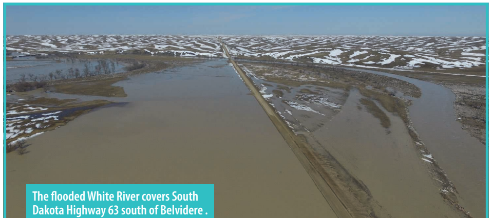
The flooded White River covers South Dakota Highway 63 south of Belvidere .

We are looking forward to a nice normal summer – we hope!!!