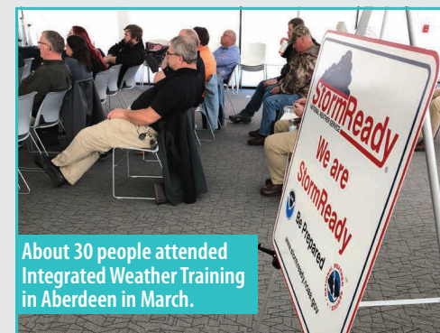
About 30 people attended Integrated Weather Training in Aberdeen in March.

More than 30 people attended the March 20 workshop.