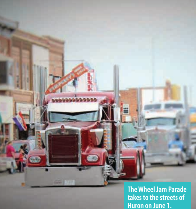
The Wheel Jam Parade takes to the streets of Huron on June 1.

Sunday, June 2 • Registration: 9 a.m. to noon • Show from noon to 4 p.m. • Family Living Center