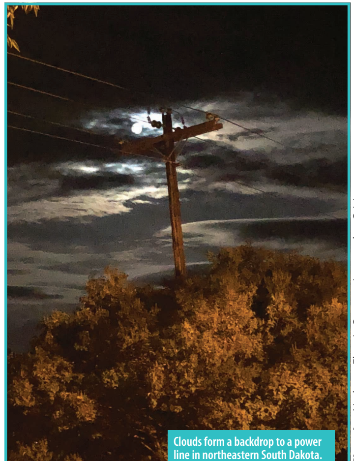
Clouds form a backdrop to a power line in northeastern South Dakota.

Although SKYWARN® spotters provide essential information