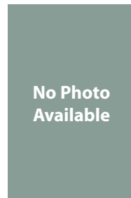
Jesslyn Estes Lower Brule